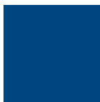
SNL Security HEX #003E73 RGB 0, 62, 115 CMYK 100, 57, 0, 38