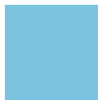
SNL Innovation HEX #72BBD8 RGB 114, 187, 216 CMYK 42, 0, 2, 10